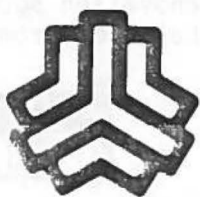
Grant MacEwan Community College

The Library is now using Envoy 100 (NAIT. Lib) to obtain interlibrary loans from the University of Alberta. Previously, a NAIT staff member retrieved books from the University of Alberta twice weekly, borrowing the books through regular circulation procedures.